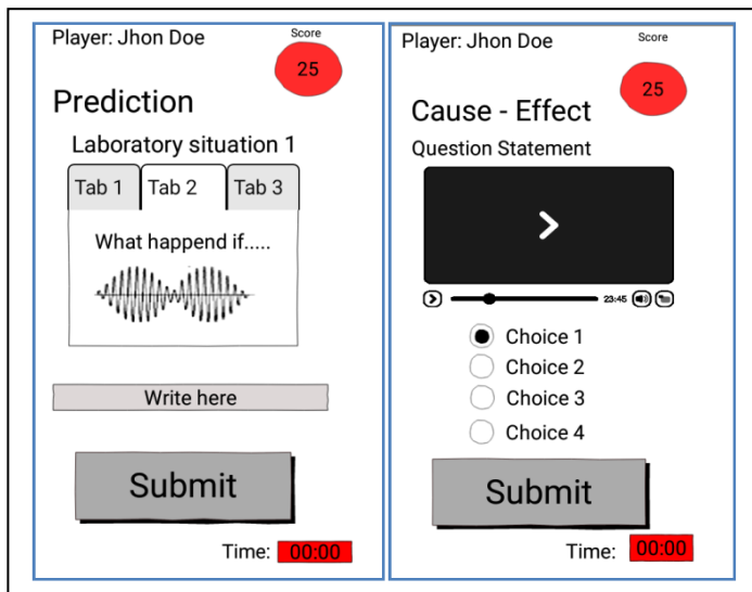
Fig. 3. Mobile app Mockup of What happens if? and Cause-effect problems

The games were divided into four groups: Trivia Games, Word Games, Prediction and Decision making. The style of question planned for different games includes multiple-choice questions, short answer and essay. Games are different each other according to particular intentions, some of them are focused in development of solving problem skills, while others have the goal of improve the agility of giving solution to a complex situation when time is a limited resource. The difficulty level of each interactive game has direct correspondence with the skills level defined in the course topics. These games are aligned with transferable skills like: decision making, working under pressure, problem solving, willingness to learn, self-motivation and analytical thinking.